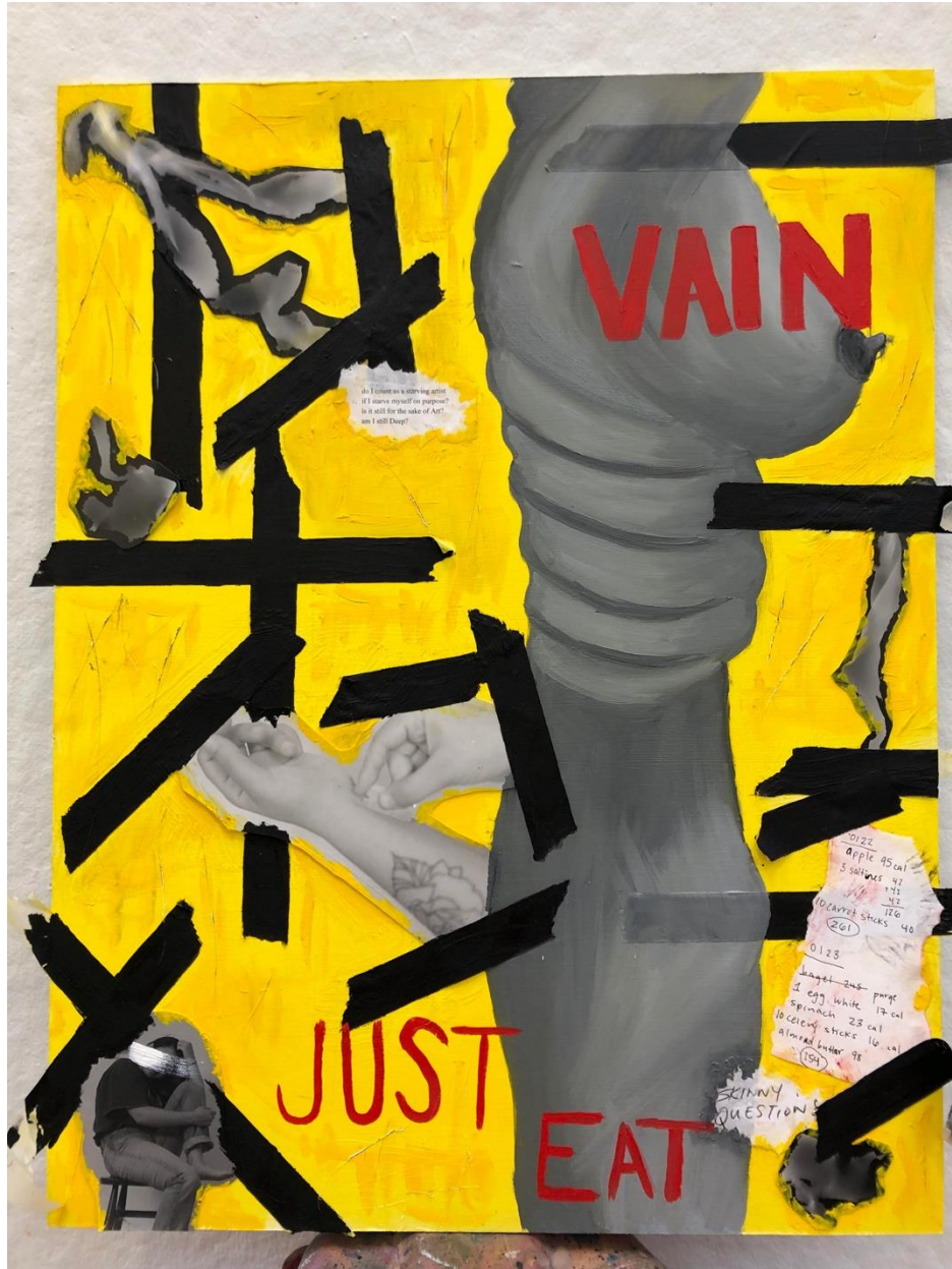
Purge oil, tape on masonite, 12" x 24", 2019.

Purge is the first piece in a series of mixed media paintings that explore the aftershocks of sexual violence in a woman of color's life. Purge deals primarily with eating disorder as a form of self-harm, accessing the cycle of internalized victim blaming and shame that survivors often face for months and years after their assault. The three other pieces in the series, each larger in scale than the last, acknowledge substance abuse, depression, and flashbacks as both symptoms and causes of further trauma.