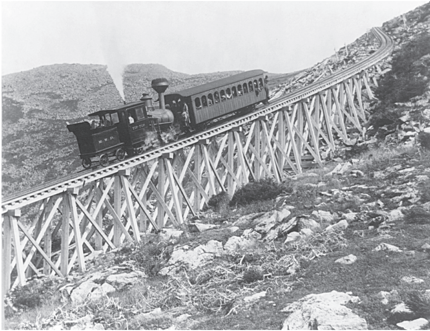
The Cog Railway climbs the steep pitch called Jacob's Ladder in 1895.

Only twice before 1967 had the Cog encountered accidents. The first was when the original Engine 1, Old Peppersass, climbed the tracks for the New