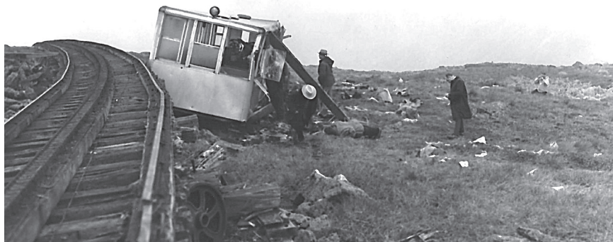
Police investigators peer at the stilled passenger car where it landed.