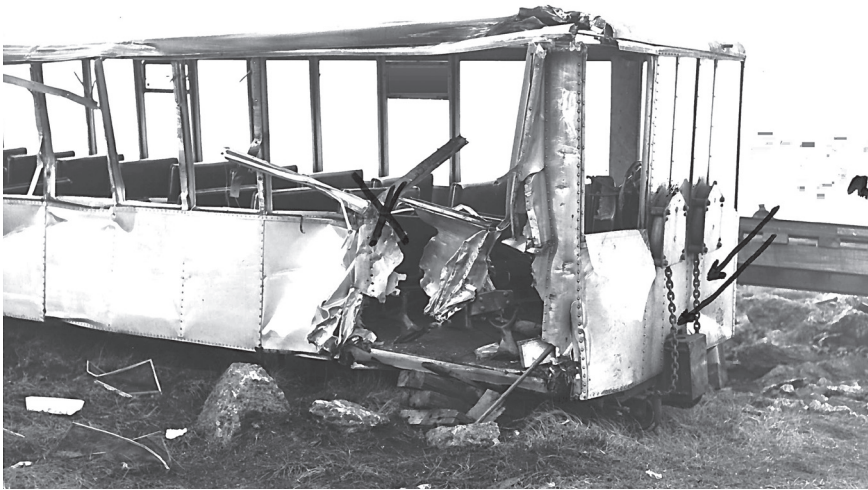
The passenger car called Chumley 11 sits crumpled after it careened out of control and crashed into rocks high on Mount Washington.

This section of flip rail was 5 feet, 4¾ inches long and when set for the siding projected 2½ inches above the cog rack. The locomotive cogwheel struck the flip rail, bending it about two inches out of line; meanwhile, the engine was lifted up, to the right, and out of the cog rack and main rails. This rendered the cogwheel and brakes useless. The locomotive and coal tender