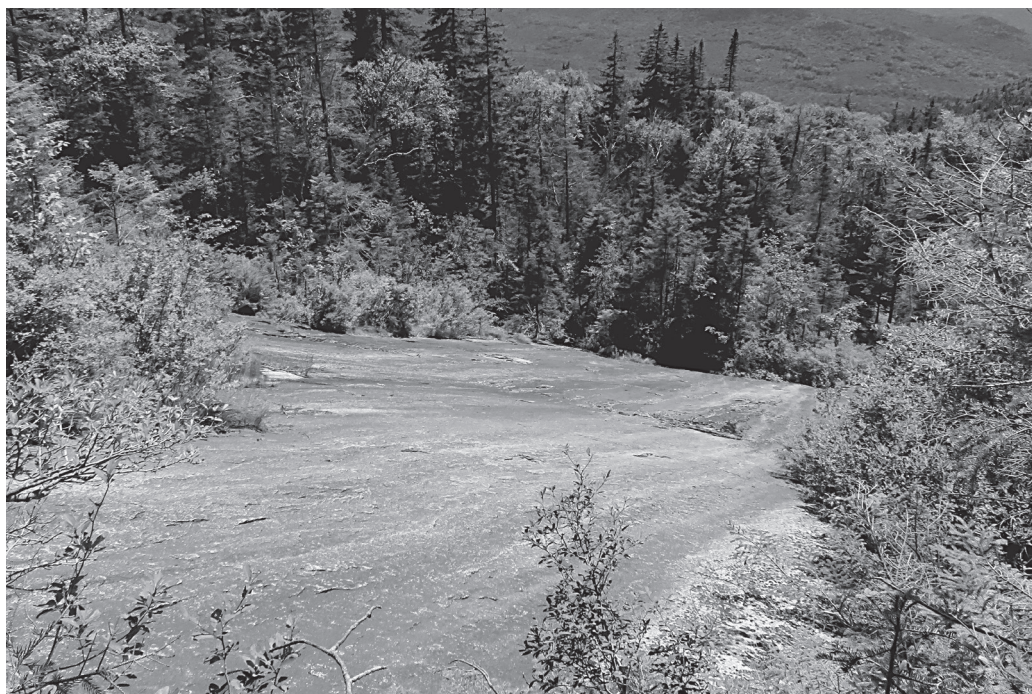
Occasionally, slabs open up a view. STEVEN D. SMITH

The slab marks the bottom of the main part of the slide, where the pitch steepens. As Clarke and Lanza noted, “Here the real climbing began. . . . We began to realize that the mountain was a mountain, after all. . . .” The open rock provided me with clear climbing for 100 feet of elevation. Clarke and Lanza preferred the climbing on what was then a “bare, rocky slide” to the shattered rock on the more famous South Slide of Mount Tripyramid: “The broad sheets of gneiss we found here are far more satisfactory for climbing purposes than the loose stones and gravel at Waterville.”