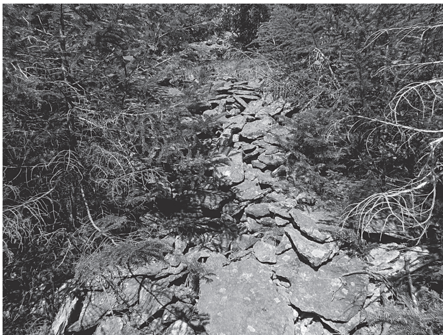
Loose rock, or scree, makes for treacherous footing but opens long views to the south.

The course of the slide could be followed even through the densest copses of conifers. Some of the ledges sequestered amid the trees bore rich carpets of sphagnum moss, giving the forest an almost prehistoric feel. These I refrained from stepping on, as in some places “leaving only footprints” is leaving too much. At about 3,550 feet I scrambled up two patches of loose shale-like scree: treacherous footing, but open enough for long views to the south. I was now high enough, as were Clarke and Lanza in 1877, to peer westward over a whale-backed southern spur of the mountain. Ahead, the slope looked appallingly steep and thick.