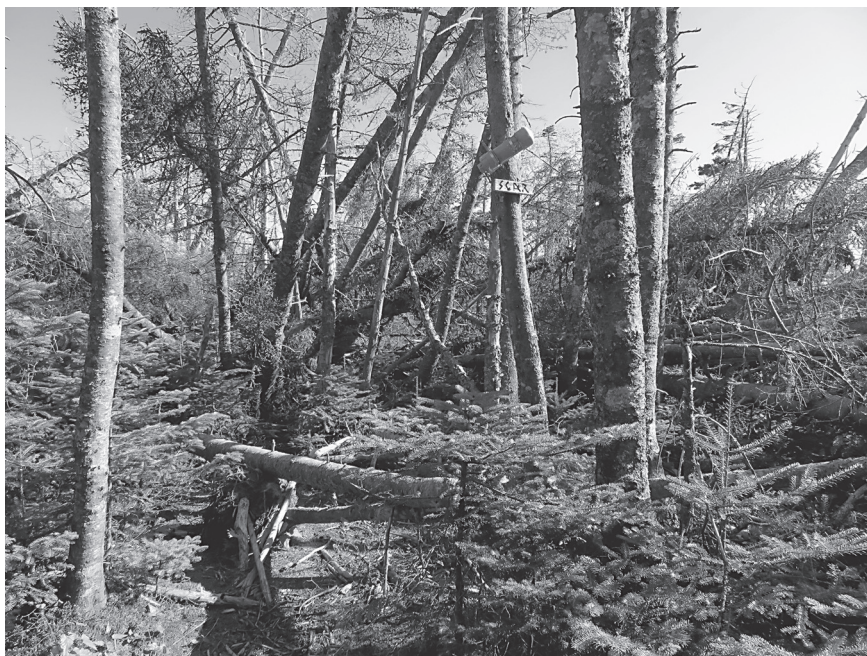
A small sign and canister holding a register mark the wooded west summit of Scar Ridge.