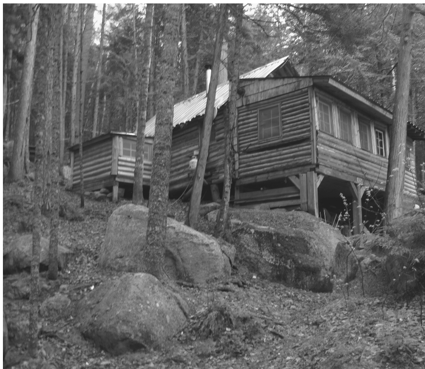
The original Debsconeag Outing Club guide's cabin, built around 1900, is the central structure in this 2012 photo. It lacks its earlier enclosed porch and left-side room.