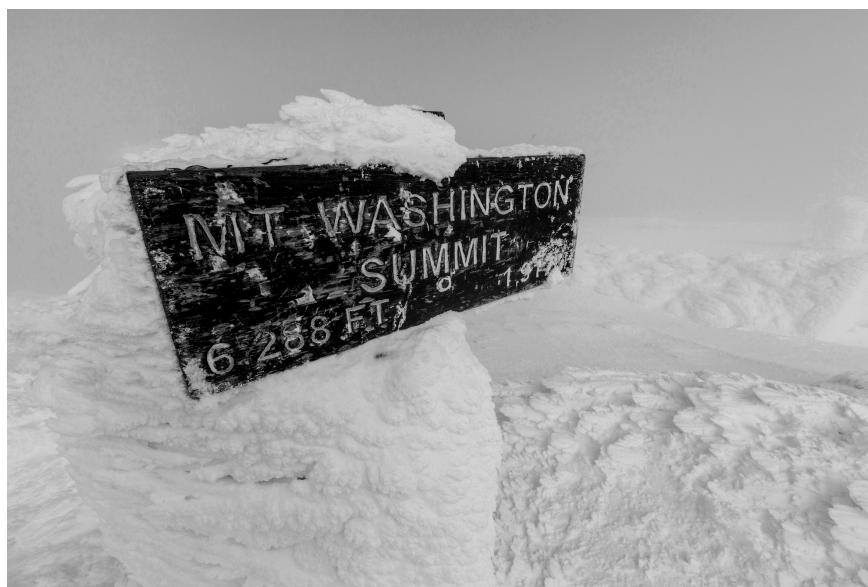
Rime ice covers the summit sign on Mount Washington.