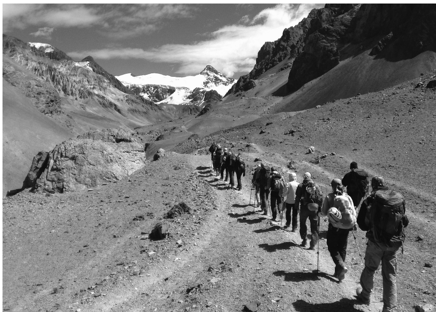
The hike in covered 14 miles over dusty, windswept valleys. STEPHEN KURCZY

Over the next three days, we gained 1,500 feet elevation as we hiked through 14 miles of dusty windswept valleys, flanked by mountain walls ribboned red-and-green, to the colorful tent village of base camp. At an altitude of about 14,400 feet, we were already as high as the tallest summit in the continental United States.