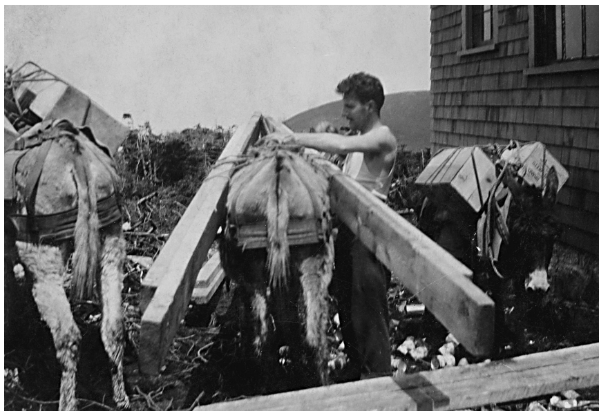
A trail worker unloads donkeys at Madison Spring Hut in 1940.

The donkeys required no special food; they foraged on the natural grasses. Once a donkey had eaten the grasses within the radius of its tether rope, a scout moved it to a new spot on the line. For water the scouts unhitched the donkeys and led them to it.