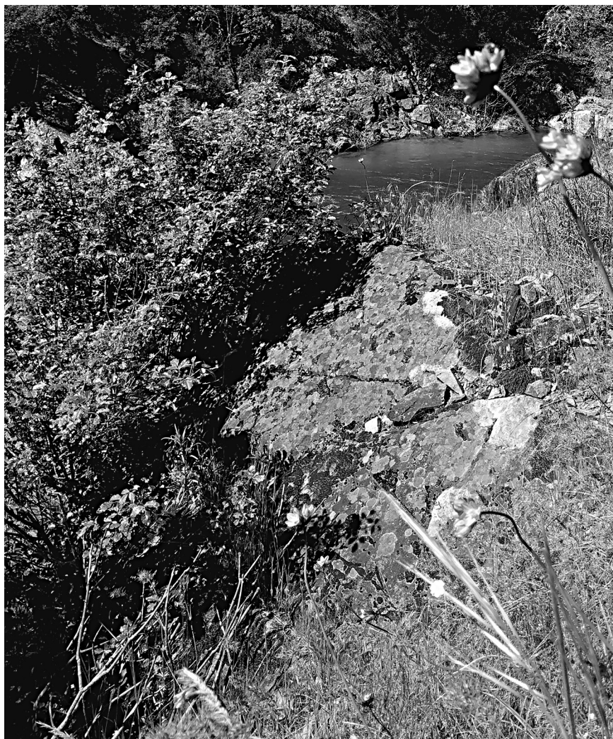
Wildflowers bloom high above the river.

activities at the river? I picked up trash, broke up campfire rings, put up No Campfires signs, tried to convince tourists to move their cars out of the fire lane—yet, if the tourists found out I was a local resident, and not a ranger, they would ignore me if I asked them to pick up the pile of still-warm dog waste I could see on the side of the trail a few feet behind them. I decided to enjoy the unexpected power, even if it was ill-gotten. “The fine for off-leash dogs is a hundred and fifty dollars,” I said. “But I’ll let it go this time if you pick up your dog’s mess.”