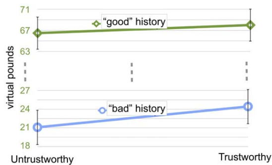
Figure 1. Average amounts invested in Untrustworthy and Trustworthy face identities with "Good" and "Bad" behavioral histories. Note that behavioral histories are represented on two different scales: the blue scale corresponds to Bad history trials; the green scale corresponds to Good history trials. Main effects of both behavioral history and face identity were significant. Error bars represent standard error. doi:10.1371/journal.pone.0034293.g001

behavioral history of their partner (i.e., without the face presented). This allowed us to compute the facial trustworthiness bonus for each character, which was the difference between the amount invested in the character's trustworthy identity coupled with a behavioral history and the amount invested in the same behavioral history alone, without any face (i.e., facial trustworthiness bonus = trustworthy face – no face). We also computed the facial untrustworthiness penalty for each character, which was the difference between the amount invested in the character's untrustworthy identity coupled with a behavioral history and the amount invested in the same behavioral history alone (i.e., facial untrustworthiness penalty = untrustworthy face – no face). The mean facial trustworthiness bonus, averaged across participants and characters, was 1.57 VP. The mean facial untrustworthiness penalty was –1.83 VP. A within-participant t-test confirmed that the difference between the trustworthiness bonus and the untrustworthiness penalty ( \Delta = 3.40 VP) was significant: t(51) = 2.94 , p = .005 , \eta^2 = .15 . However, a within-participant t-test comparing the absolute values of the trustworthiness bonus and the untrustworthiness penalty failed to reveal a significant difference between the two: t(51) = .16 . Thus facial trustworthiness appears to symmetrically shift investments upwards or downwards (relative to no face) according to its valence.