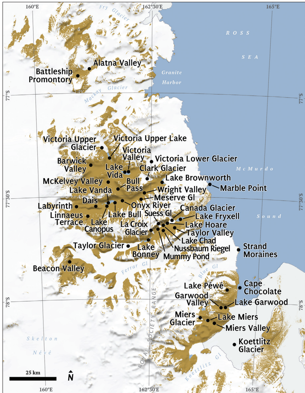
Figure 2. McMurdo Dry Valleys, Antarctica. Labeled areas represent study locations and major geographic features referenced in the tables and text.

but many soils (~35%) lack extractable soil invertebrates and approximately 50% of McMurdo Dry Valleys soils that contain invertebrates have only one invertebrate species (Freckman and Virginia 1997; Wall Freckman and Virginia 1998).