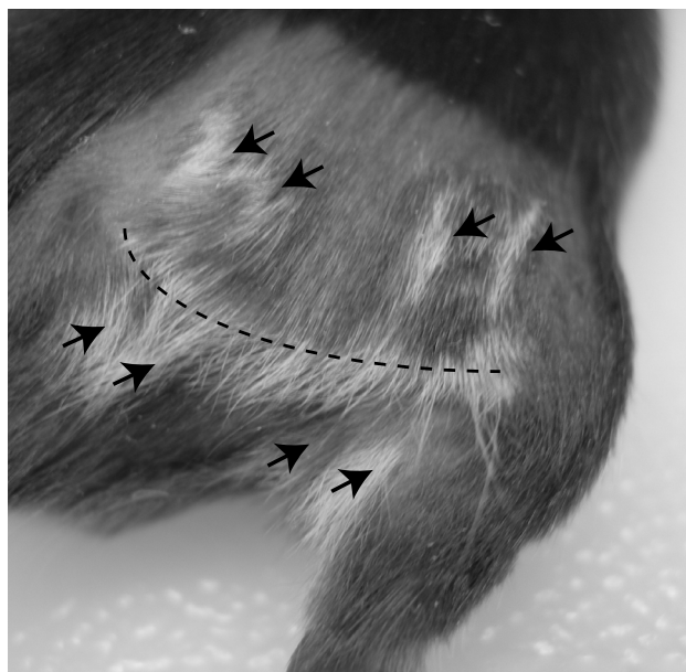
Figure 1: Vitiligo initiation at site of surgery. Mice bearing intradermal B16 tumors on the right flank were treated by anti-CD4 monoclonal antibody to deplete regulatory T cells, followed by surgical tumor excision, as we have previously described [63]. 3 weeks after surgery, vitiligo was observed along the surgical incision line (dotted line), and at points where surgical clips had pierced the skin (arrows).

The major focus of melanoma immunotherapy over the past 20 years has been on breaking T cell tolerance to melanocyte differentiation antigens, and vitiligo is a common occurrence with such therapies. The