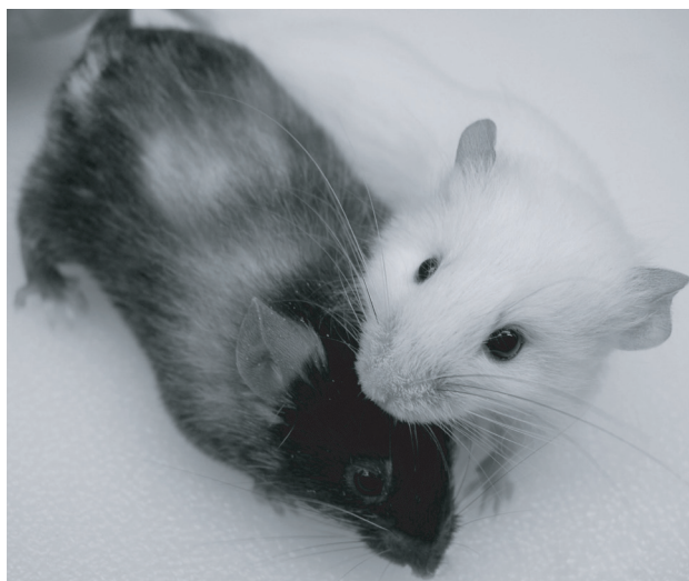
Figure 2: W^{sh} mice as a model of vitiligo insufficiency. A vitiligo affected mouse (left) and a W^{sh} mouse (right).

Using the W^{sh} model, we have recently found that the absence of melanocytes impairs the development of T cell memory to melanoma [9]. Our data show that W^{sh} mice prime gp100-specific CD8 T cells that are equivalent in frequency and phenotype to wild-type hosts. However, they are unable to develop the robust effector memory T cell responses that characterize hosts with vitiligo [9]. Instead, melanocyte-deficient mice develop small, T_{CM} populations, similar to those in vitiligo-unaffected wild-type mice [9]. Moreover, when gp100-specific CD8 T cells were first primed in tumor-bearing W^{sh} mice, and then adoptively transferred into melanocyte-sufficient mice with vitiligo, the unique T_{EM} phenotype and homing function of these T cells was restored [9]. Thus, the fate of melanoma antigen-specific CD8 T cells was not pre-determined at priming, but rather was altered by exposure to melanocyte destruction. Additionally, robust populations of gp100-specific T_{EM} cells could be rescued