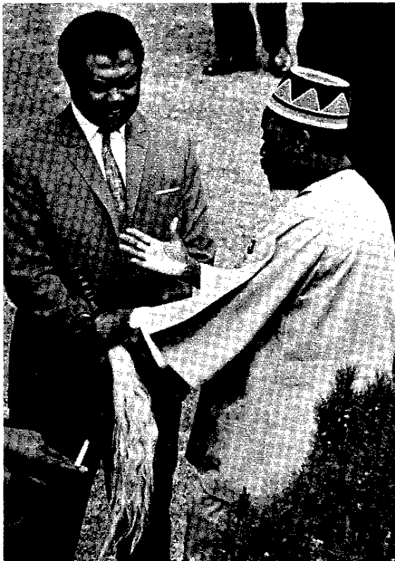
Below: Mboya wearing traditional Colobus skin cape.