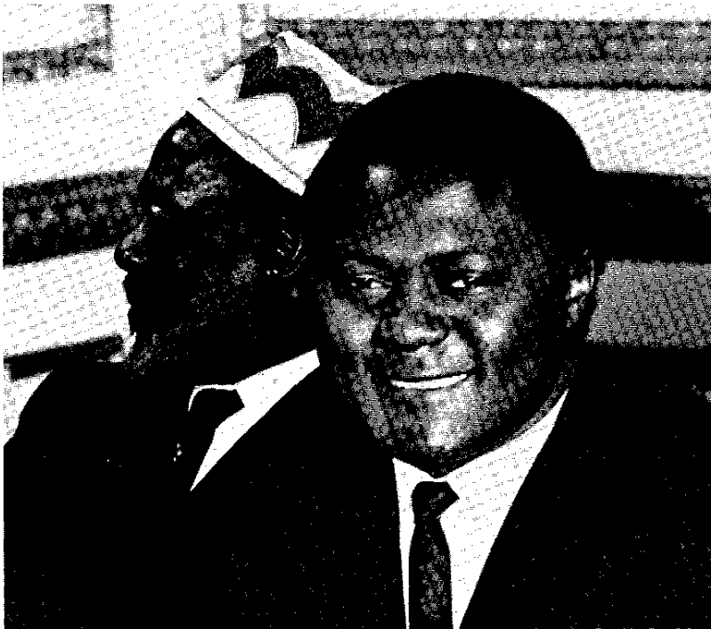
Left: Mboya with Kenyatta.