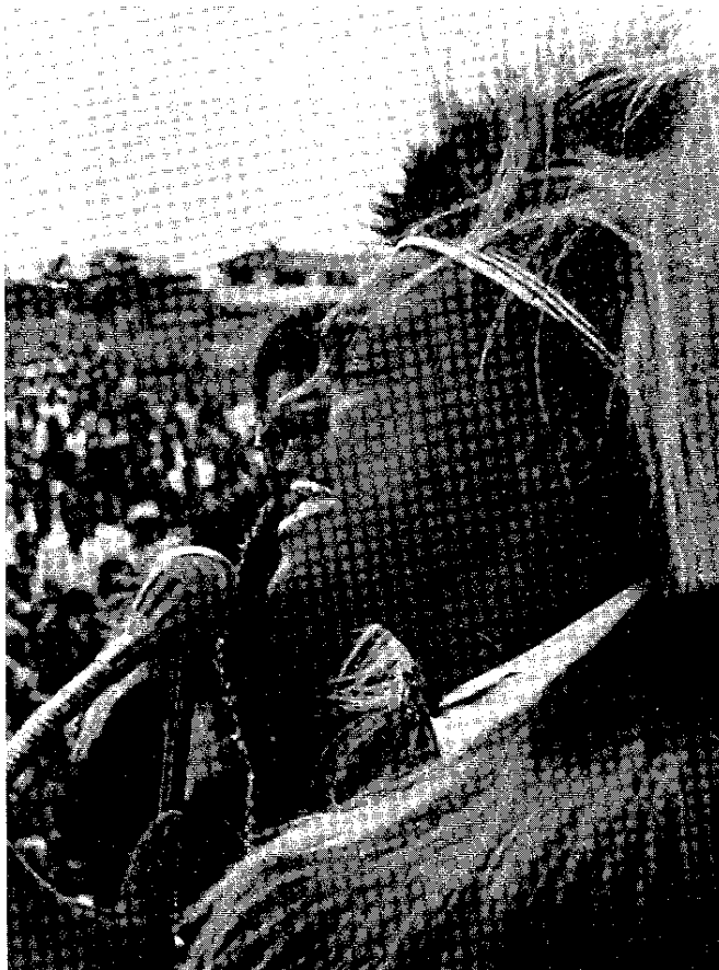
Below: Mboya with President Kenyatta and K.A.N.U. leaders, election celebration, 1962.