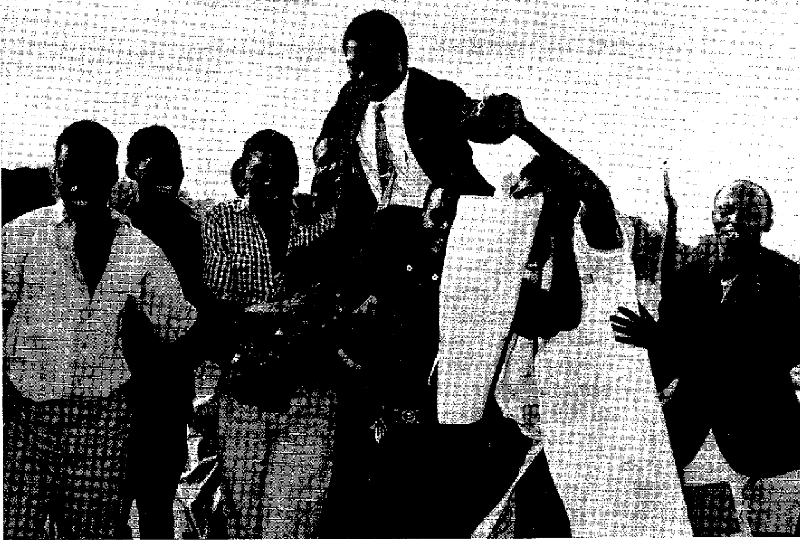
Mboya with rural supporters and traditional dancers.